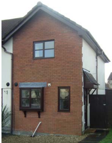
A well appointed two Bedroomed end of Terrace House in a quite cul-de-sac location.