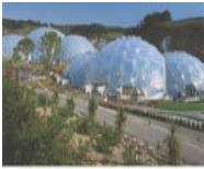
THE EDEN PROJECT - CORNWALL

For further details, availability or to book online visit www.cornishholiday.info